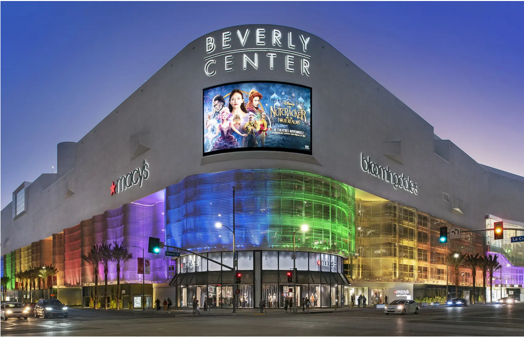
LA Pride, June